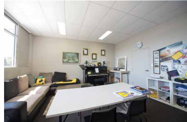
DIRECTORS OFFICE & MEETING ROOM

The Lee Academy resource rooms. A library of music, programs from professional productions from all over the world, library of books & DVDs on all manner of subjects for dance & dancers : including anatomy, nutrition, psychology & stage craft. Also a library of sheet music & backing tracks.