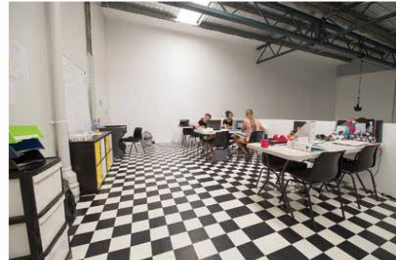
PROFESSIONAL DEVELOPMENT CLASSROOM