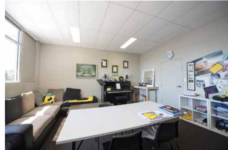
DIRECTORS OFFICE & MEETING ROOM